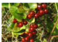
Smilax and Xanthoxylum

Live in a ground floor flat or share a communal garden?