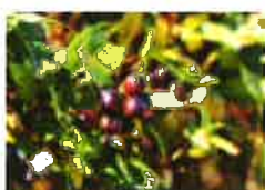
Ligustrum (privet), or laurel